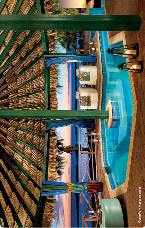
Oceanfront massage cabin

WARM SWIRLING WATERS, TENSION MELTING STEAM, A COUPLES MASSAGE BY THE SEA — YOU'VE BEEN GENTLY TRANSPORTED TO HEAVEN.