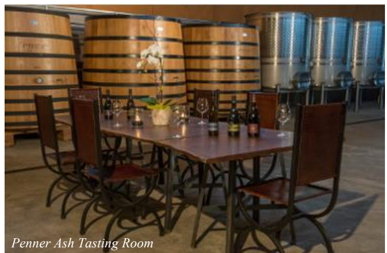
Penner Ash Tasting Room