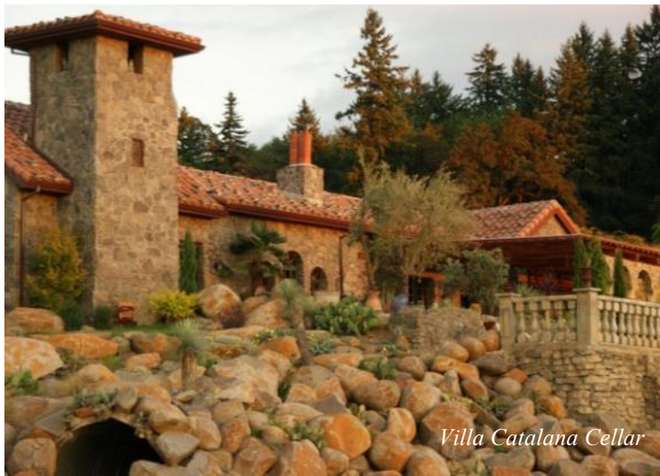
Villa Catalana Cellar

Upon arrival at Portland International Airport (please arrive by 2 PM), we drive to our hotel in the heart of Oregon's Willamette Valley Region. We check in and have time to refresh after our flight. We begin our winetasting adventure at Villa Catalana Cellar, whose Cascade Berry Fortified Wine liquor won a gold medal at the 2015 San Francisco Chronicle Wine Competition and whose 2013 Syrah won bronze. They are a small winery, producing less than 500 cases a year whose tasting room was inspired by San Clemente de Tahull, a 12th century Romanesque church in Catalonia, Spain. From there it is not far to Five O Three Restaurant where we gather for a welcome winetasting dinner. D