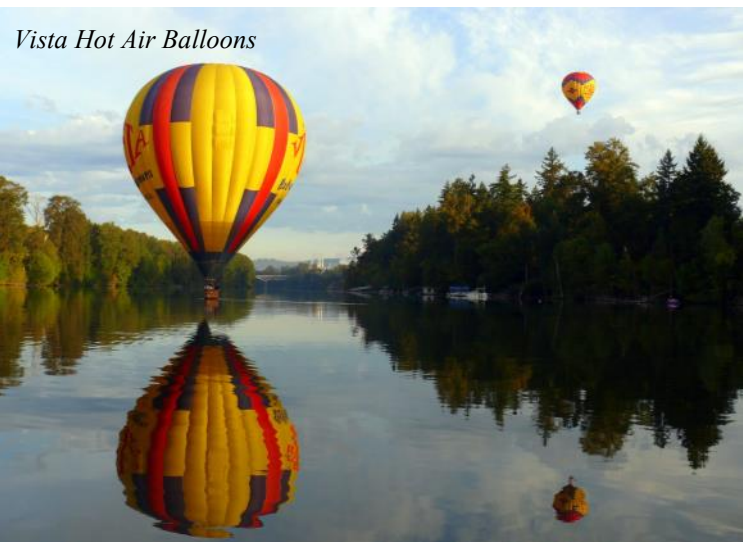
Vista Hot Air Balloons

Abbreviations for Meals B=Breakfast L=Lunch D=Dinner