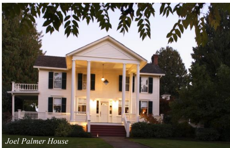
Joel Palmer House

This morning we return to the airport for our return flight home. Flights to depart after 11:00 am. B